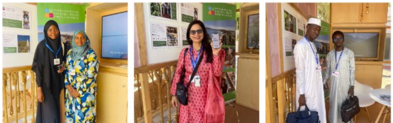
COP28 delegates visiting the INTO booth