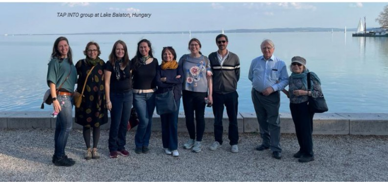
TAP INTO group at Lake Balaton, Hungary

These outputs are consistent with the expected activities and outcomes outlined in the application. The programme has evolved to include expanded regional cooperation and new rounds of funding, demonstrating its adaptability and long-term sustainability.