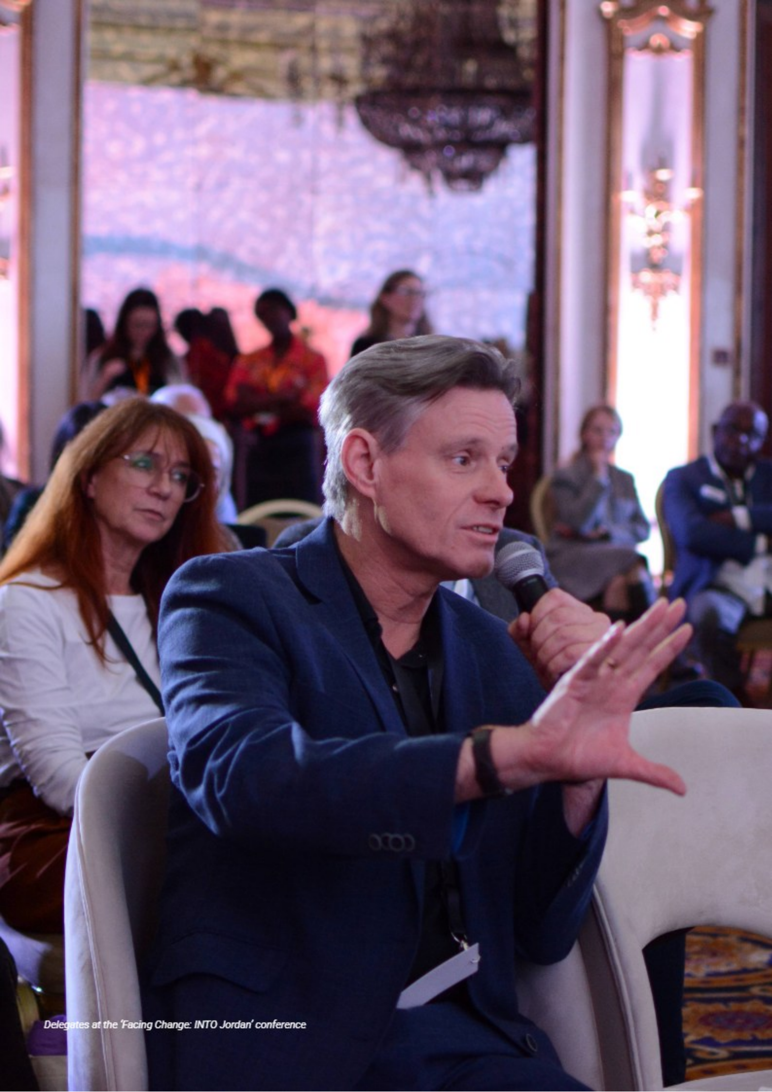
Delegates at the 'Facing Change: INTO Jordan' conference