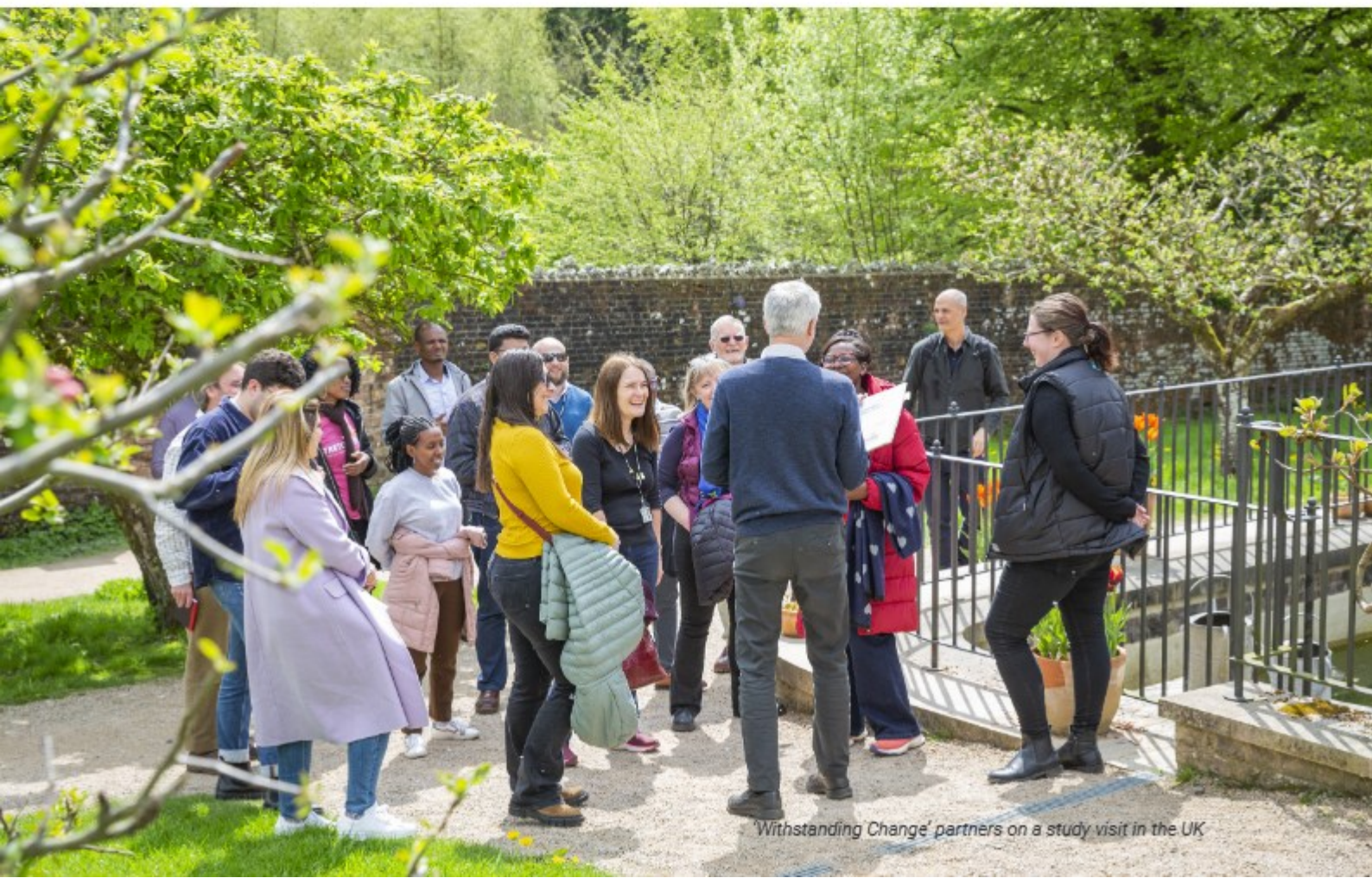
'Withstanding Change' partners on a study visit in the UK

From strategic conferences and small-but-mighty grants to digital storytelling and leadership development, INTO continues to turn heritage into action - building a resilient, collaborative movement that protects and celebrates cultural and natural heritage worldwide.