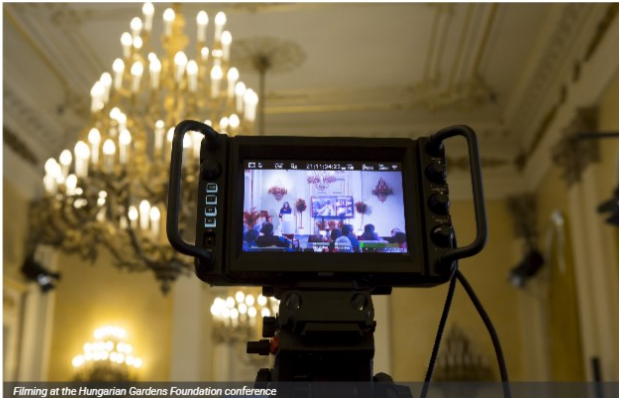
Filming at the Hungarian Gardens Foundation conference