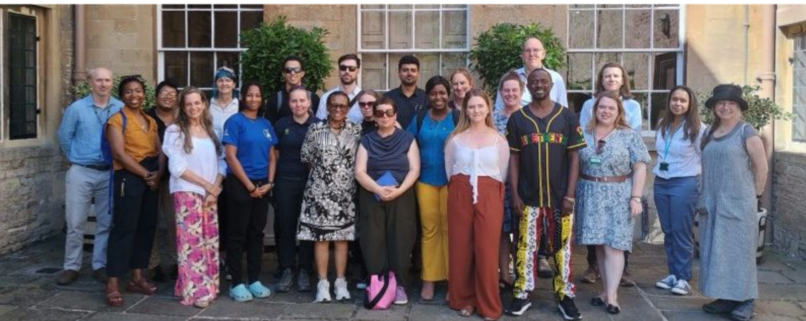
INTO's RISE community gathered at Dyrham Park, National Trust