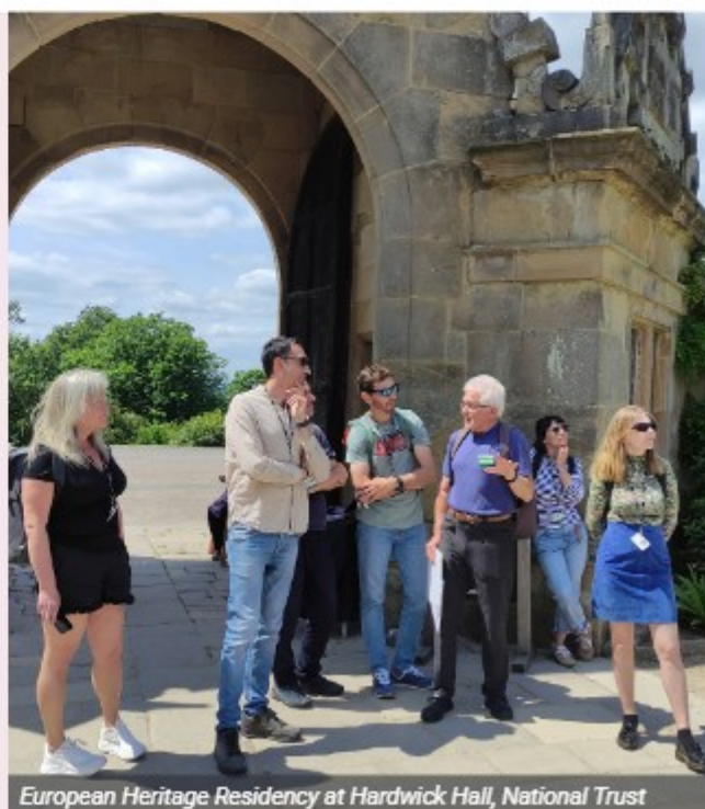
European Heritage Residency at Hardwick Hall, National Trust

As INTO looks ahead, the Incubator remains a vital tool for nurturing leadership, strengthening organisations and growing the global heritage movement.