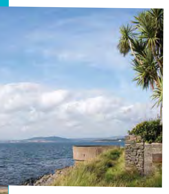
Above: Mount Stewart, Northern Ireland