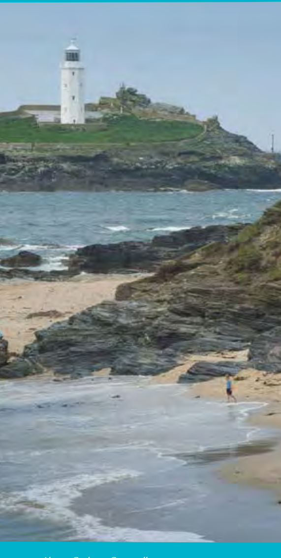
Above: Godrevy, Cornwall