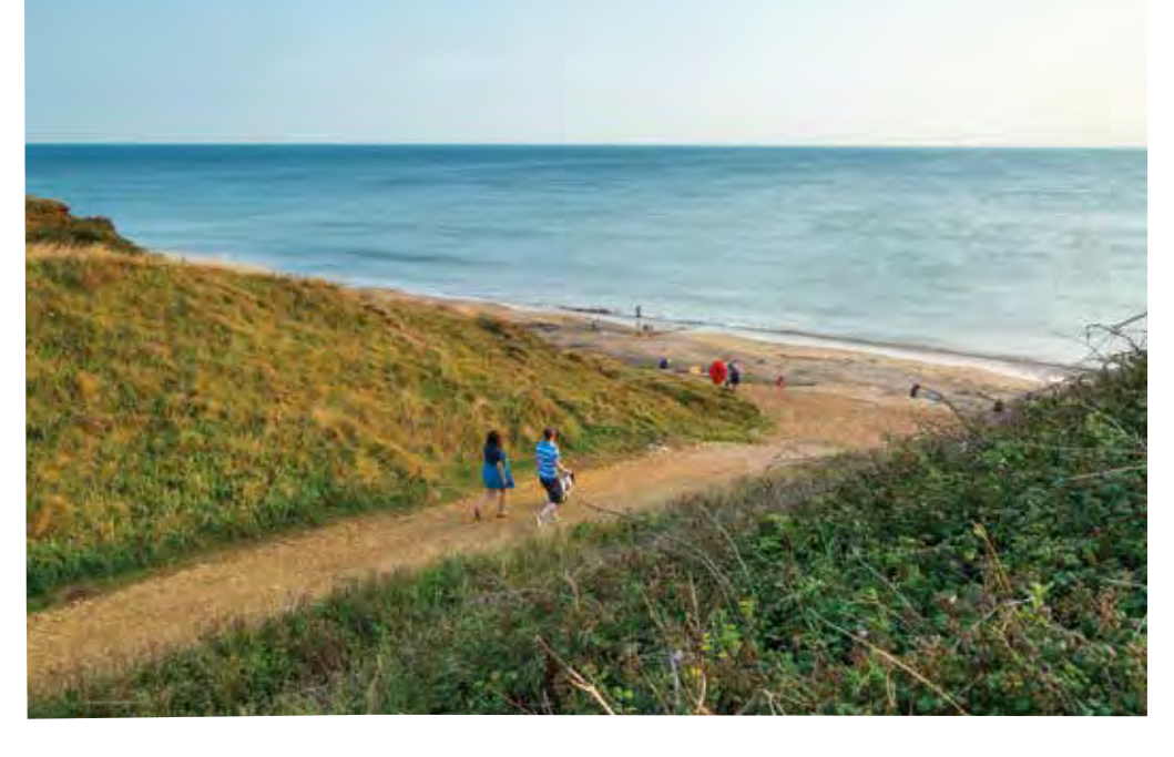
Above: Brook Bay, Isle of Wight

The research highlights that the Trust is a significant player at the coast, and that we need to lead by example and step up to the challenges of coastal change management.