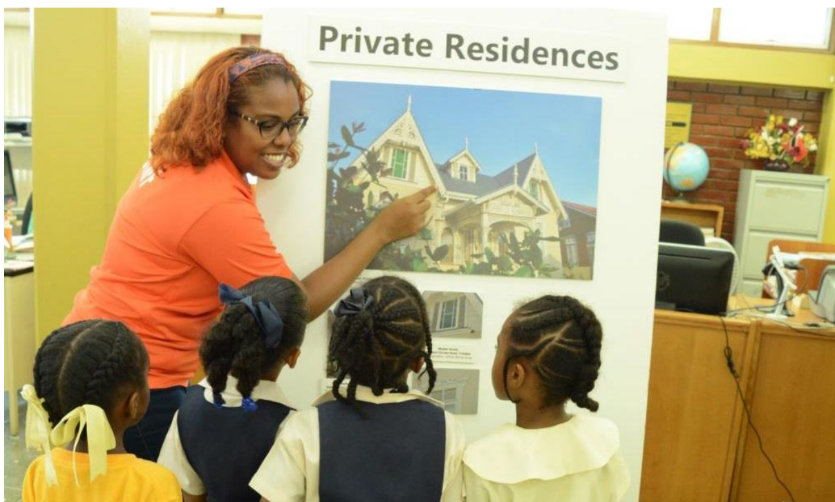
Heritage Keepers programme