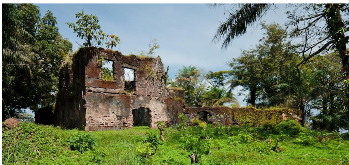
Bunce Island

Since 2017, the Monuments and Relics Commission has worked with the World Monument Fund to carry out documentation and stabilisation efforts at the site, building on impetus generated by a small grant from INTO. Bunce Island bears testimony to a transformative and traumatic period in local history and so much work has focused on engagement with the local community, seeking to understand the value of the site from their perspective and reflect this in the preservation strategy.