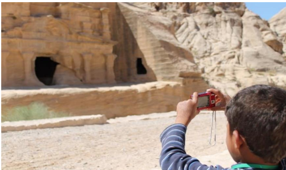
Jordanian child engages with heritage at Petra

PNT's work with children and youth has included design and implementation of curricula relating to Jordan's heritage, reaching well over 3000 young people between 2010-2019. More recently, PNT commissioned an impact assessment of its education, outreach and awareness programme, delivered by EUNIC, the European Union National Institutes for Culture, which identified PNT's programmes as the largest and most sustainable civil society initiative in the Ma'an Governorate.