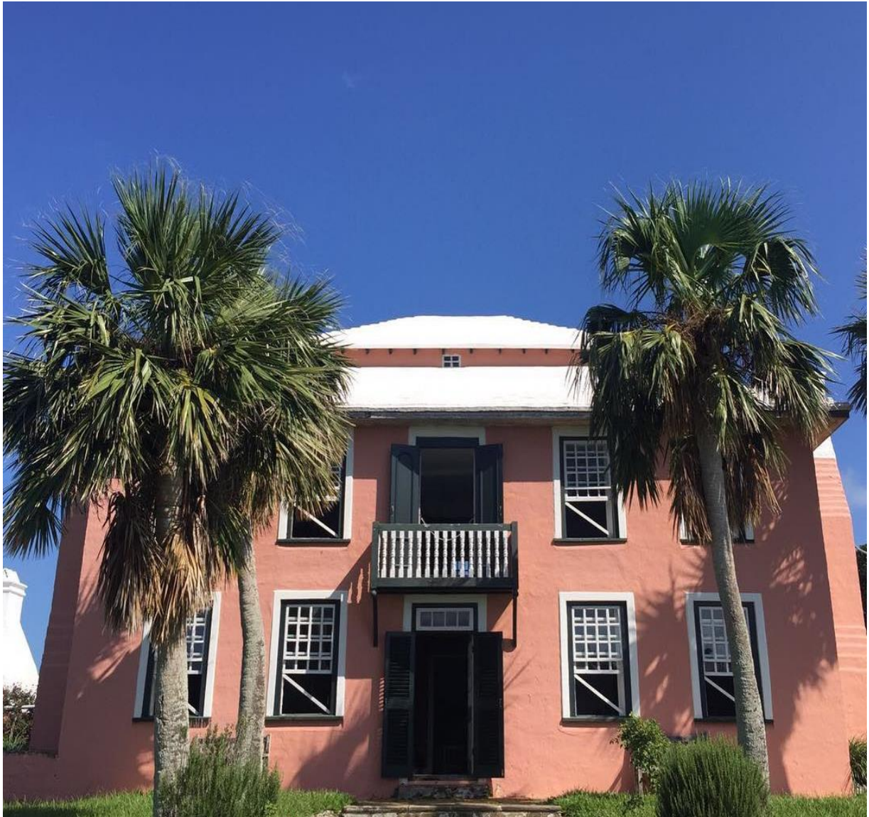
Bermuda National Trust's property Verdmont

that links this to other sites of African diasporic interest on the island. In view of its success as an initiative, attendees agreed that there remains much more work to be done in this space, on Bermuda and elsewhere.