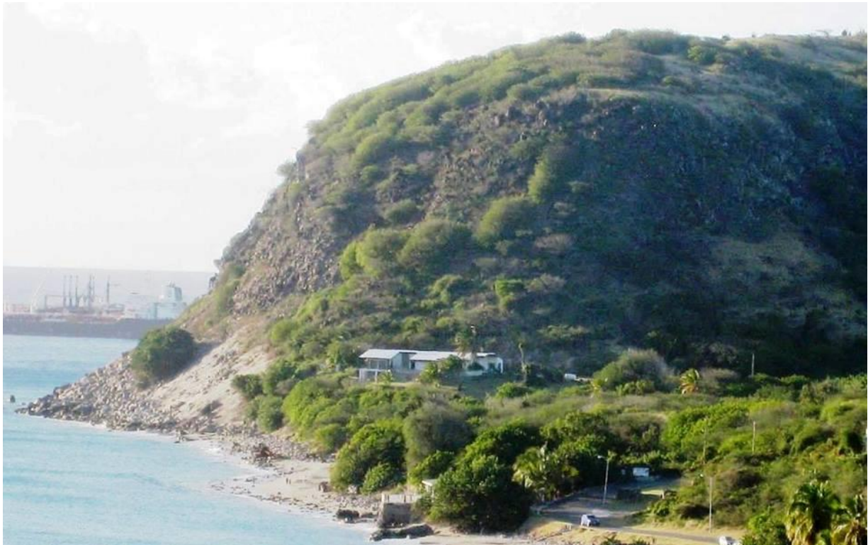
Statia Slave House

In spite of the loss of life, the St. Eustatius Historical Foundation points to this as a pivotal moment in moving forward the abolition agenda in the Dutch Empire, noting that the event was much discussed within the colonial government on Curaçao and the central government in The Hague. Slavery was finally abolished in the Dutch West Indies in 1962.