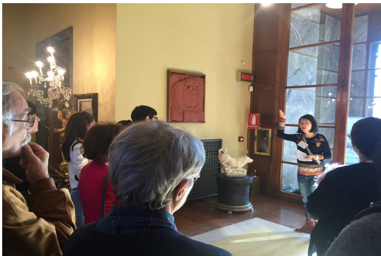
Ponte tra culture

As part of Ponte tra culture , recent migrants to Italy have interpreted FAI collections in their native language for both Italians and people from their own community. For example, volunteers with roots in Africa and Latin America have interpreted the Mexican and African collections at the Villa Panza in Arabic and Spanish. Pictured is a Chinese resident in Italy who has presented an East Asian collection to an Italian audience, situating it within her personal experience and understanding of China. FAI highlights how the FAI Ponte tra culture programme brings together the rich diversity of modern Italian society, building a bridge to ensure that all those living in Italy can appreciate it.