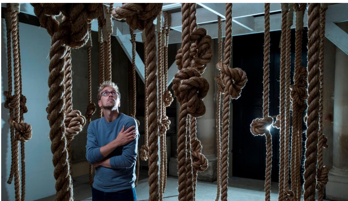
Prejudice and Pride at Kingston Lacy

In 2017, activity was centred around the 50 th anniversary of the partial decriminalisation of homosexuality in Britain, under the banner of the 'Prejudice and Pride' programme. This took place at properties right across the NT (EWNI) portfolio, including an installation at Kingston Lacy, a seventeenth century Italianate country house in Dorset, south-west England.