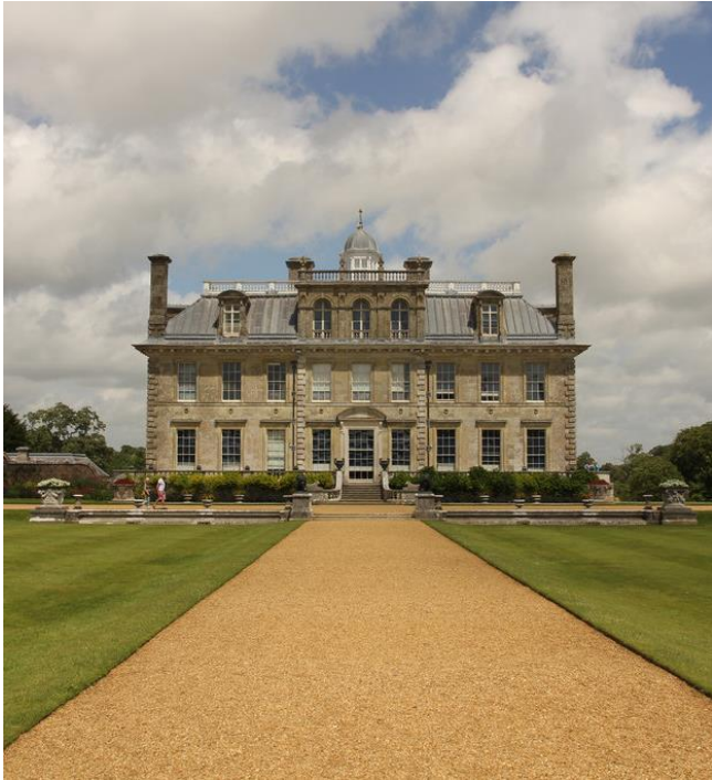
Kingston Lacy