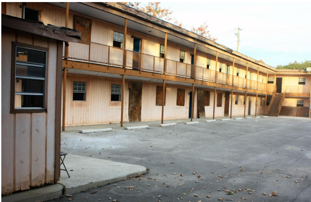
The A G Gaston Motel in Birmingham, USA