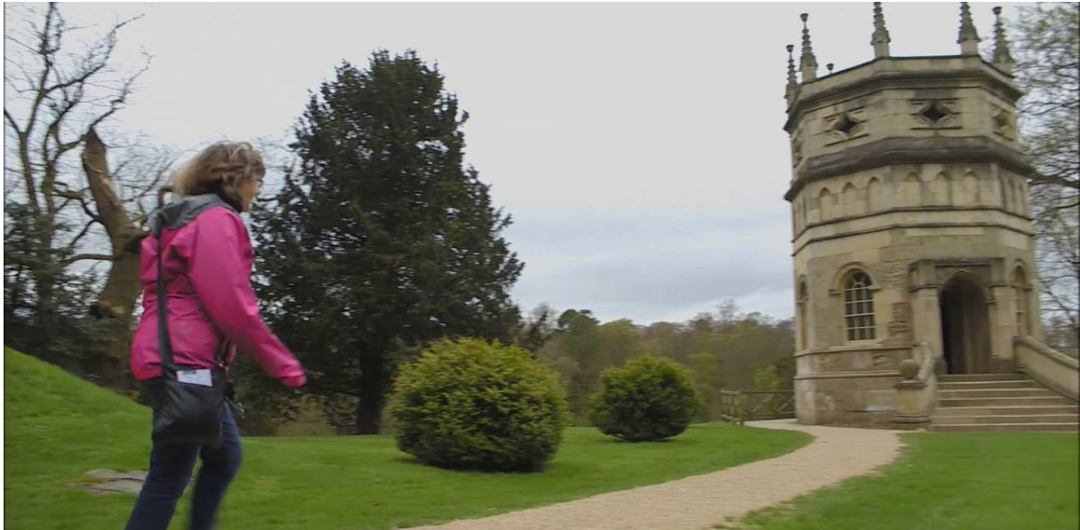
Volunteer at Fountains Abbey

Volunteers are key to the success of the National Trust movement across many member countries, but words of caution came from some delegates in Bermuda about the assumption that volunteers should always form part of the workforce. European members from countries with a tradition of an amplified state role in civil society, particularly in the former Soviet Bloc, suggested that an absence of volunteering culture within society can be a challenge for funding applications that assume a given cultural frame of reference.